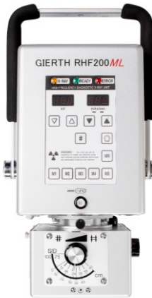
GIERTH RHF200 ML Resonance high frequency inverter with the all purpose Vet unit