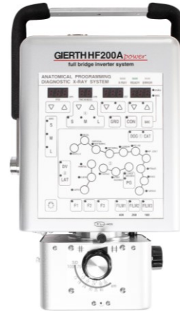
GIERTH HF200 power High frequency X-ray unit with anatomical program