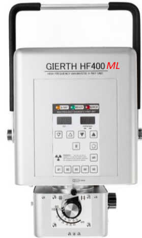
GIERTH HF400 ML The „power pack“ of our portable high frequency X-ray units