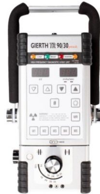
GIERTH TR90/30 peak Maximum power and minimum size and weight