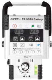
GIERTH TR90/20 Battery Battery powered X-ray unit