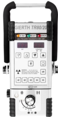
GIERTH TR80/20 High performance and minimum size and weight