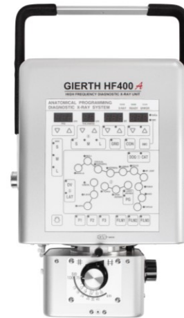
GIERTH HF400 A The „power pack“ of our portable HF X-ray units with anatomical program