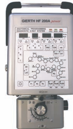
GIERTH HF 200 A power High frequency X-ray unit with anatomical program