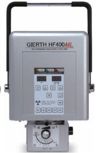
GIERTH HF 400 ML The "power pack" of our portable HF X-ray units