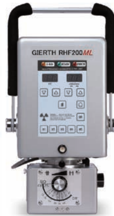
GIERTH RHF 200 ML Resonance high frequency inverter with the all purpose vet unit