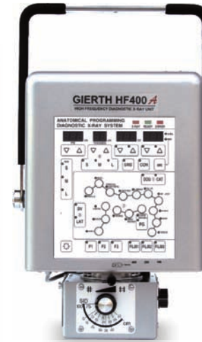
GIERTH HF 400 A The "power pack" of our portable HF X-ray units with anatomical program