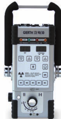
GIERTH TR 90/30 Maximum power and minimum size and weight