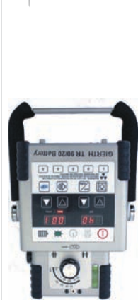
GIERTH TR 90/20 Battery Battery powered X-ray unit