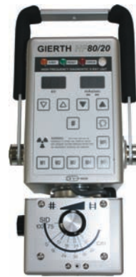
GIERTH HF 80/20 High performance and minimum size and weight